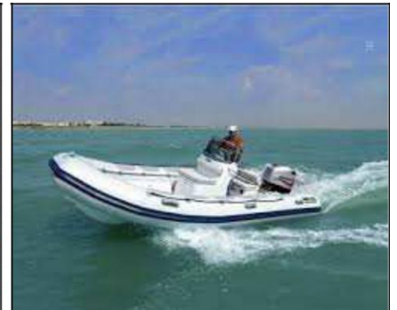
Boarding - Disembarking